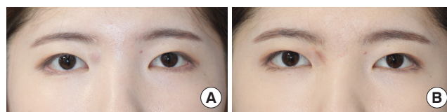
Fig. 2. (A) A 20-year-old female with an epidermal cyst on the upper eyelid. (B) Patient's photograph 12 months after surgical excision.