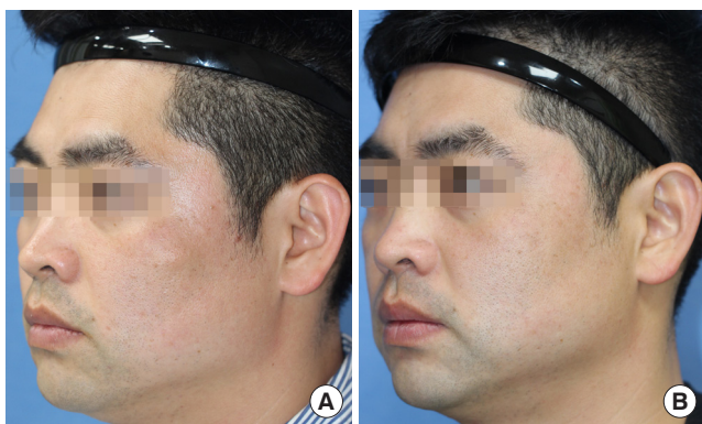
Fig. 1. (A) A 36-year-old male with an epidermal cyst on the left cheek. (B) Patient's photograph 12 months after CO 2 laser excision.

Concerning postoperative complications, wound dehiscence developed in two patients in the surgical excision group (3.3%); additional repair was performed for these patients. There were no cases of wound dehiscence in the CO 2 laser excision group, but the difference between the two groups was not statistically significant ( p = 0.154). Postoperative hematoma was observed