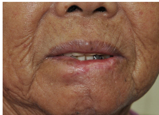
Fig. 4. Case 13. The patient who underwent mucosal V-Y advancement flap for vermilion reconstruction had oral incompetence in resting.

The mucosal V-Y advancement flap is easy and provides good aesthetic results when properly applied, especially in the medial side defect of vermilion. It can be used when the vermilion defects with lengths do not exceed 50% of the entire vermilion or when the extra portion of the oral vestibule mucosa on the lingual side near the defect is abundant [4]. On the other hand, it is difficult to apply to the defect near the oral commissure, and it has potential disadvantages such as a decrease in the anterior-posterior dimension of the lip [15,16]. In our study, two patients who underwent mucosal V-Y advancement flap had oral incompetence (Fig. 4). Temporary drooling and fluid incontinence were the most common complaint in two patients for the