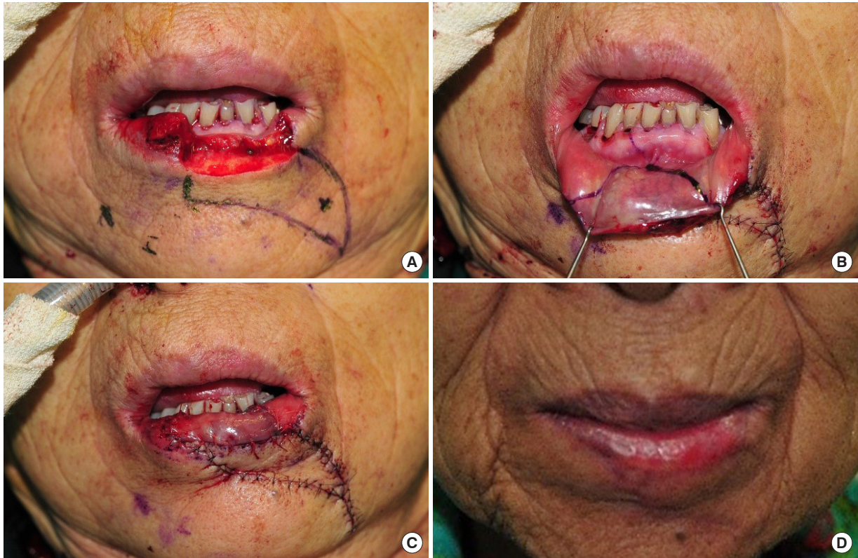
Fig. 1. Case 6. (A) A mental V-Y advancement flap for lower lip reconstruction is designed after tumor ablation. (B) Vermilion defect is reconstructed with the mucosal V-Y advancement flap. (C) Immediately postoperative view. (D) Two-month postoperative view.