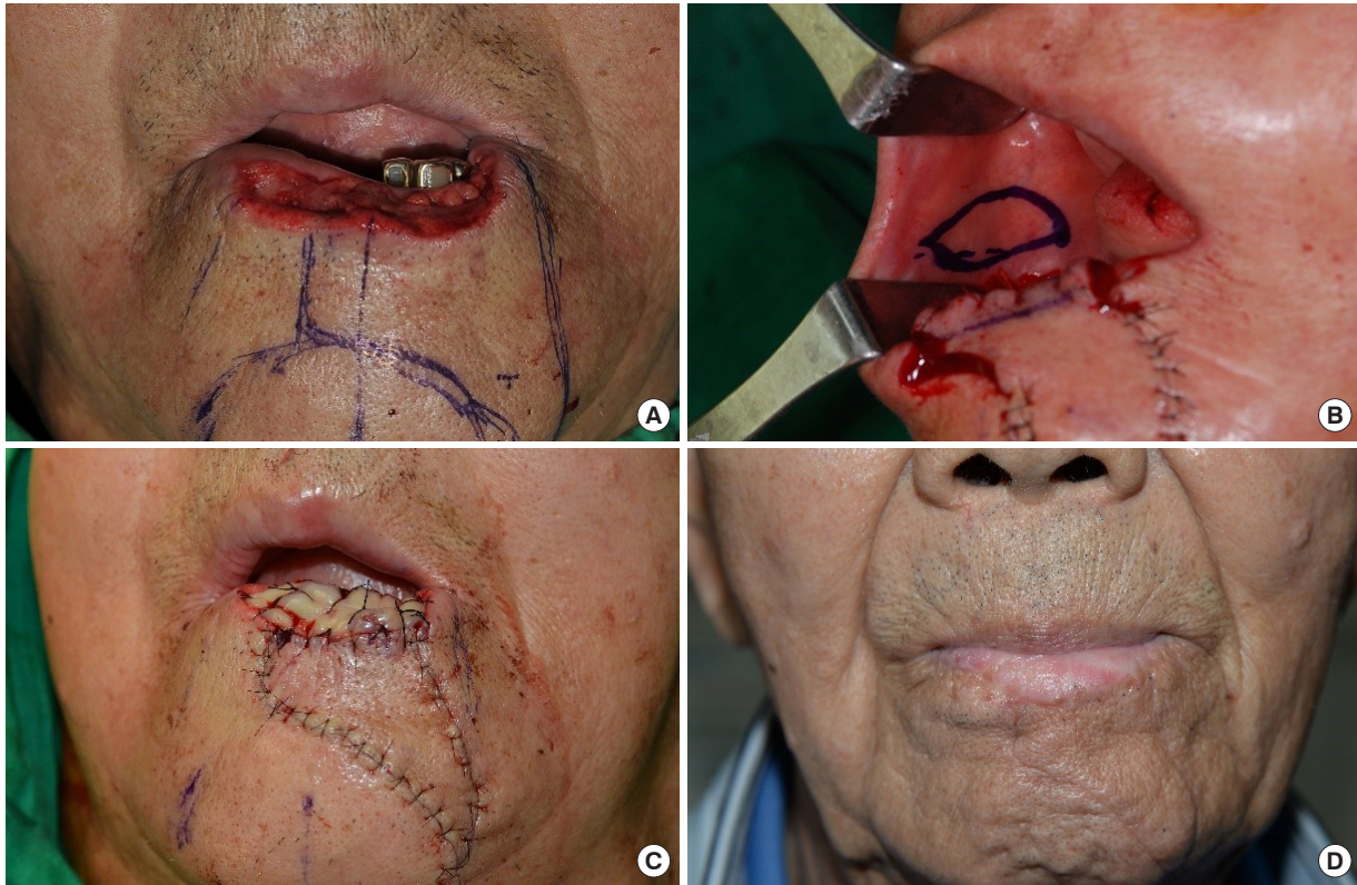
Fig. 3. Case 11. (A) A mental V-Y advancement flap is designed after tumor ablation. (B) Vermilion defect is reconstructed with the buccal mucosal graft. (C) Immediately postoperative view. (D) Two-month postoperative view.