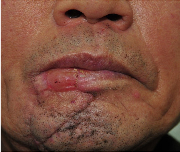
Fig. 5. Case 10. The patient who underwent buccal mucosal flap for vermilion reconstruction had commissure deformity, although a secondary procedure (division and de-bulking) was done.

first few months following surgery. This is because the flap has limited applications in large defects of the mucosal surface of the lip. But this problem resolved within a few months postoperatively.