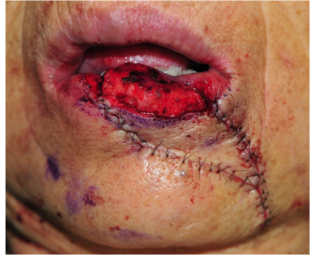
Fig. 6. In a mental V-Y advancement flap, the base of the triangle was de-epithelialized by about 1 cm in width, after which it was advanced to the defect site to restore the volume of the resected lip.

Compared to other vermilion mucosal reconstruction, the advantages of using a buccal mucosal graft for vermilion reconstruction are that it is easy, provides good aesthetic results and has little or no residual donor site morbidity. Use of the hard palate as a donor site has been reported [17,18]. We used the mucosa of the buccal side of the oral cavity as donor site of mucosal graft. Harvesting the buccal mucosa is convenient because the donor site is within the same surgical field, and the characteristics of the buccal mucosa are more similar to those of the lip than the palatal mucosa. In addition, the donor site is closed