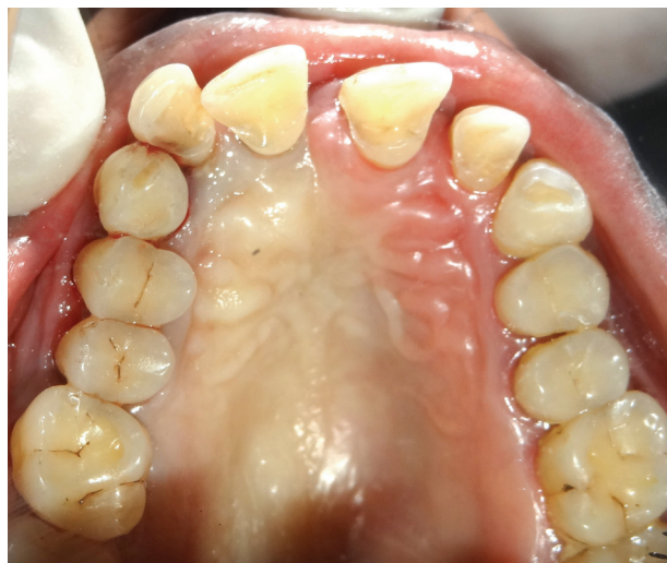
Fig. 3. Blanching of the palatal mucosa crossed the mid-palatine raphe in some cases.

All patients were instructed not to take any analgesics for 24 hours before the planned surgery. The CCLAD system used (Wand ® ; Milestone Scientific Inc., Livingston, NJ, USA) had a disposable, lightweight, pen-like needle linked by microtubing to a local anesthetic cartridge. It is operated using a foot control that automates local anesthetic delivery. After pre-surgical preparation, AMSA injection was delivered using a 30-gauge, ultra-short needle by a single operator (S.T.) who had previously administered AMSA injection using CCLAD to more than 100 patients in various dental procedures. This operator was not involved in any further steps of the investigation, including assessment of the anesthesia or flap surgery. The injection site was the point that bisected the maxillary first and second premolars—half way between the free gingival margin and the mid-palatine raphe (Fig. 2). Patients were placed in a supine position, with slight hyperextension of the head