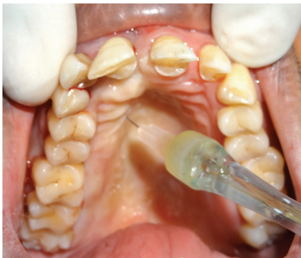
Fig. 2. Delivery of AMSA injection using the CCLAD system

to 3–4 mm in most of the teeth, with significant reduction in BoP. They no longer required periodontal flap surgery in the whole quadrant and were treated without further involvement in the study. Thus, 35 patients were ultimately selected for periodontal flap surgery under AMSA injection. Fig. 1 outlines the sample selection.