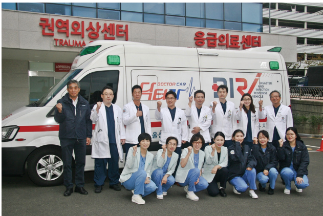
Fig. 3. “Mobile Trauma Unit”, dedicated vehicle with doctors for inter-hospital transfers or direct treatment at the accident site.

outcomes from before to after trauma center establishment may have been due to the lack of significant changes for patients with severe TBI, since such patients were being treated rapidly by the neurosurgeons prior to the opening of the trauma center.