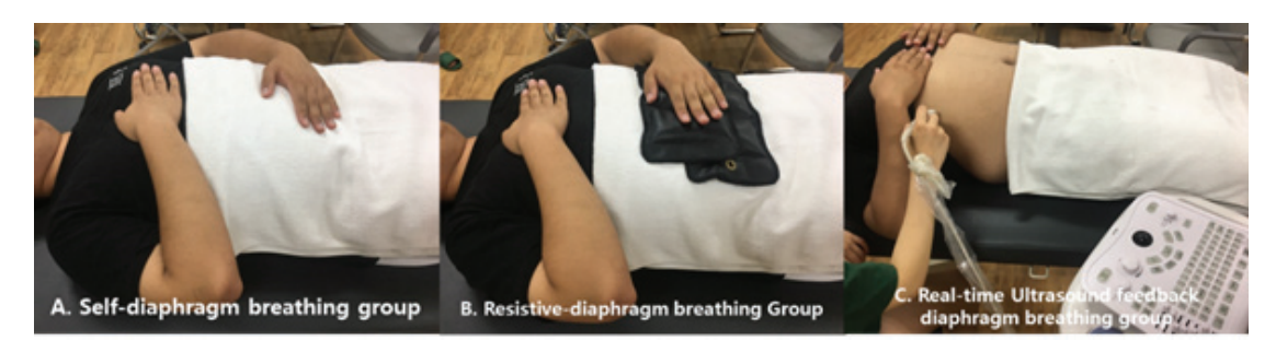
Fig. 2. Three groups according to diaphragm breathing method

the sandbags during inspiration and expiration. The sandbag weight was applied differently for each subject and at levels 11 to 13 of 'Rating of Perceived Exercise (RPE)'. The UFDBG applied breathing exercises while in the supine position, visually identifying live motion images of the diaphragm provided by the tester using a real-time ultrasound imaging device. The breathing exercise for each group were conducted in two sets for 15 minutes with a five-minute break between the sets. A sufficient 10 minute break was allowed after completing the breathing exercises. All diaphragm breathing exercises were conducted under the guidance and supervision of one examiner (Fig. 2).