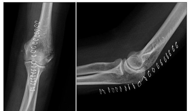
Fig. 2. Anteroposterior radiograph and lateral radiograph of the left elbow after open reduction.

Most irreducible elbow dislocations are caused by interposition of soft tissues, such as brachial muscles and collateral ligaments. These dislocations are also caused by the radial head protruding or buttonholing through the lateral collateral ligament