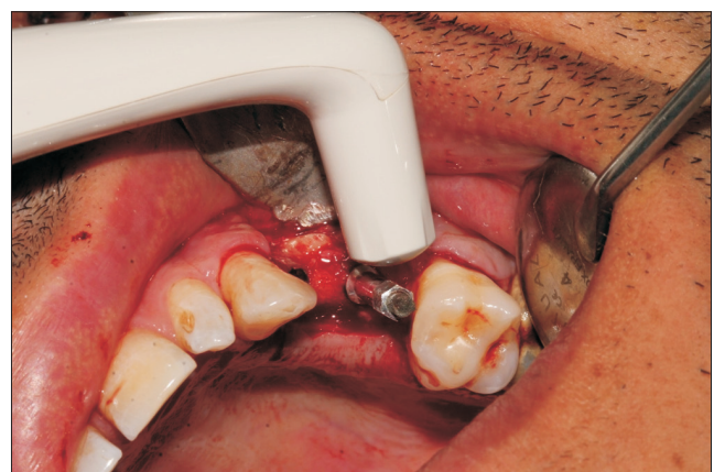
Fig. 1. Measurement of implant stability by an Osstell device (Integration Diagnostics) immediately after installation. Naser Sargolzaie et al: The evaluation of implant stability measured by resonance frequency analysis in different bone types. J Korean Assoc Oral Maxillofac Surg 2019

This study enrolled 59 patients (29 women and 30 men)