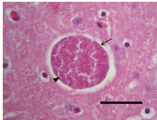
Fig. 2. Histosection of the brain tissue from a feral cat infected with Toxoplasma gondii stained with H&E stain. Arrow: Tissue cyst wall; arrowhead: hundreds of bradyzoites. Bar = 40 μm.