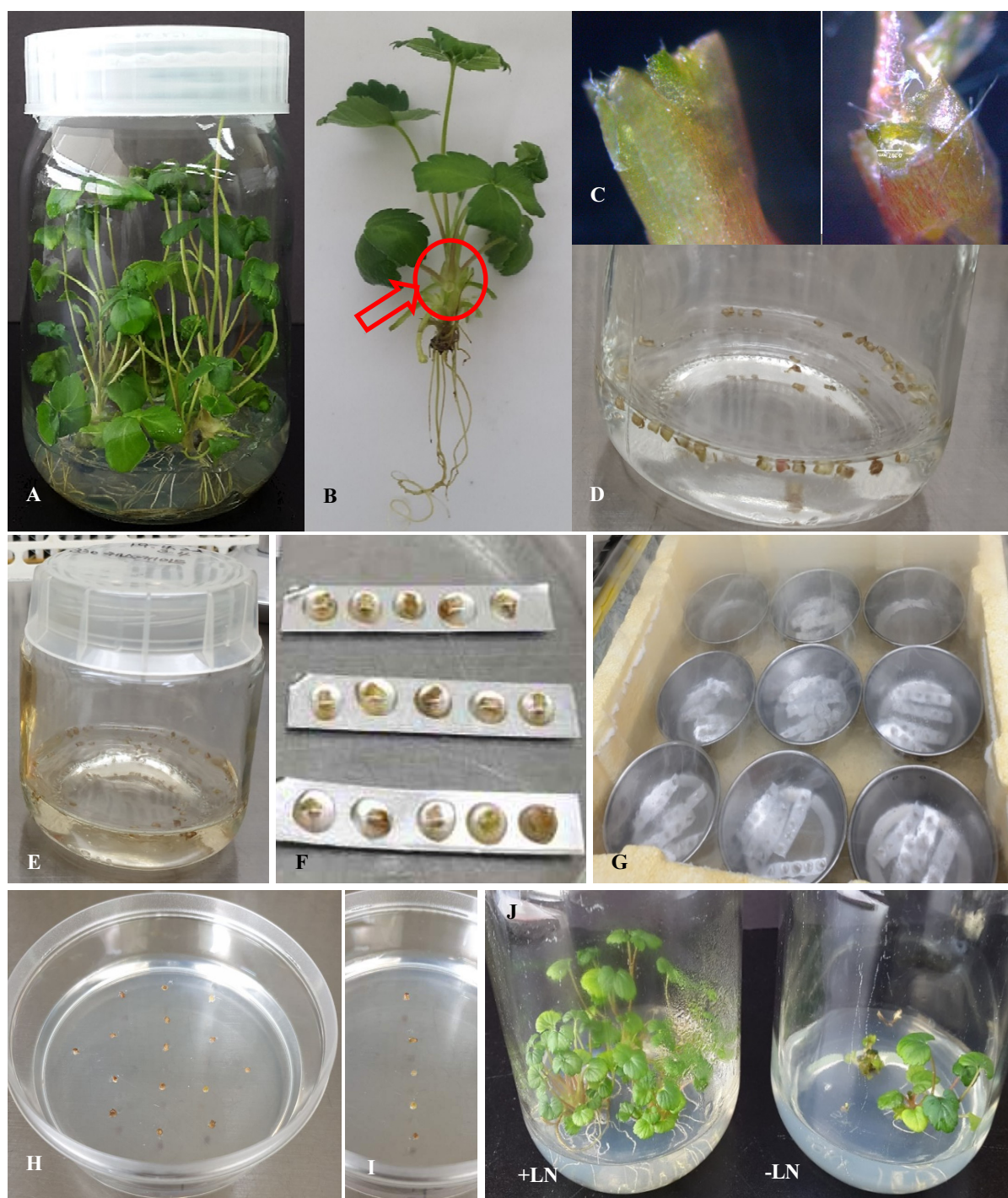
Fig. 1. Cryopreservation of shoot tips of Strawberry ( Fragaria × ananassa ) by droplet-vitrification. (a) Source of in vitro grown strawberry plantlets used for shoot tips collections. (b) Position of the shoot tips on the plantlets (marked in red color) from which shoot tips are excised. (c) The excised shoot tips used for cryopreservation experiment. (d) Shoot tips are treated with loading solution (LS, C4) for 40 min at 25°C. (e) Dehydrated with PVS3 (B5) for 60 min. (f) Dehydration of shoot tips in 2.5 µL PVS3 droplets carried on sterilized aluminum foil strips. (g) Immersion of aluminum foil along with shoot tips into the liquid nitrogen (LN) for 1 h. (h) Cryopreserved shoot tips were unloaded in MS+0.8M sucrose for 40 min at 35°C for thawing. (i) Inoculating the cryopreserved shoot tips on post-thaw culture medium containing \text{NH}_4\text{NO}_3 -free MS medium with \text{GA}_3 1.0 + BA 0.5 for 5 weeks and later cultured on MS medium with BA 0.5 for 9 weeks.