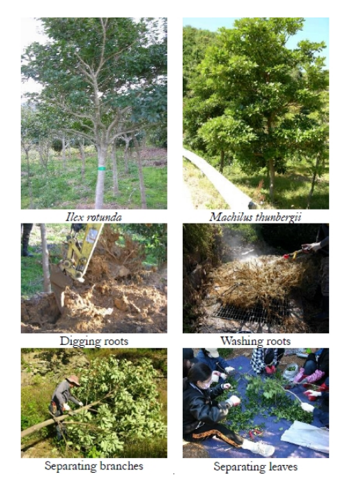
Fig. 1. Growing conditions and harvesting of study trees.

The tree specimens were dug in late October 2018, and fresh weights of each part such as stem, branch, leaf, and root were measured (Fig. 1). Digging and fresh weight measurement were conducted applying the KFRI (2007)'s and Jo et al. (2014)'s standard methods for biomass survey and analysis. When digging the trees, the size of each specimen including stem diameter at breast height of 1.2 m (DBH), crown width, and tree height was measured with reference to Jo et al. (2014)'s methods. The soils under the