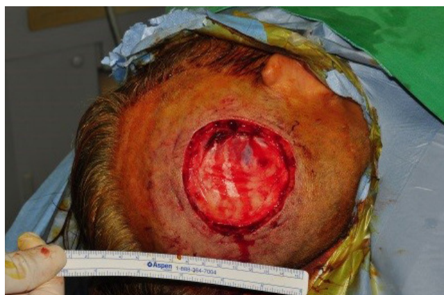
Fig. 2. Total excision was performed, including a 1-cm safety margin.