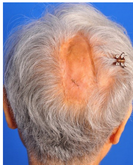
Fig. 6. Complete healing was observed, without evidence of recurrence during a 7-month follow-up.

Diagnosis is made by imaging, including ultrasound and abdominal CT. At recent, the incidence of RCC increased in conjunction with improvements in image device. More than 70% of RCCs are found incidentally on routine imaging. At the time of diagnosis, metastatic disease is present in approximately one-third. RCC is known to primarily metastasize in to lymph nodes, bone, contralateral kidneys, lungs, liver, adrenal glands, brain, and less frequently to skin. According to previous studies and reviews of RCC, metastatic RCC to the skin is rare. Less