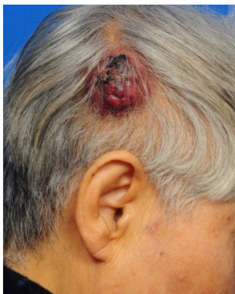
Fig. 1. A red-to-purple, protruding lesion measuring 3.0×3.5 cm was noted at the right parietotemporal area.

The patient was referred for excision of the mass. Under the general anesthesia, total excision with periosteum was performed, including a 1-cm safety margin (Figs. 2, 3). The excised mass examined microscopically by frozen and paraffin sections. The histopathological examination showed clear cells with round nuclei and abundant cytoplasm. The clear cells also appeared to form glandular or acinar structures, and have nuclear pleomorphism typically found in RCC (Fig. 4). All margins