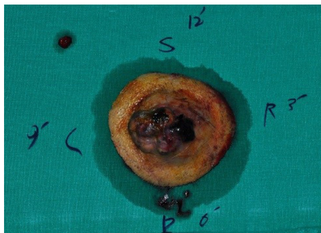
Fig. 3. Clinical photograph shows the excised lesion.