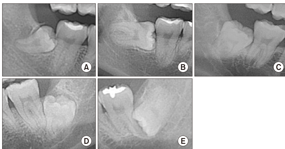
Fig. 2. Spatial relationship. Mesoangulated (A), horizontal (B), vertical (C), distoangulated (D), reverse mesioangulated (E) was defined when the long-axis of the third molar was impacted between 11° to 79°. Horizontal and vertical were defined as cases where the angle between the adjacent second molar was 80° to 100° (almost perpendicular) and -10° to 10° (almost parallel), respectively. When the long axis was -11° to -79°, it was designated distoangulated. Reverse was defined when the crown of impacted third molar was more root-oriented than horizontal.

All patients underwent panoramic x-ray imaging before extraction. Based on the panoramic x-ray image, the impacted mandibular third molar was evaluated for three major parameters: spatial relationship, depth, and ramus relationship/space available 7-9 . This retrospective study was approved by the Institutional Review Board of the Gangnam Severance Hospital (approval No. 3-2019-0118), and the informed con-