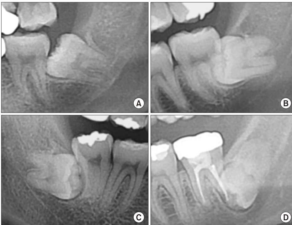
Fig. 3. Depth. A. Level A, when more than half of the crown of impacted third molar was existing above the cervico-enamel junction (CEJ) of the adjacent second molar. B. Level B, when less than half of the presented crown was above the CEJ. Level C (C) and Level D (D), when the entire crown of the impacted third molar was located below CEJ of the adjacent second molar. Level C was defined as a condition when more than half of the impacted third molar crown was located superior to the mid-level of the adjacent second molar root. Third molar crown levels inferior to the aforementioned reference was categorized as level D.

According to the difficulty, the spatial relationship was scored on a scale of 1 to 5 as follows: Mes (1), Hor (2), Ver (3), Dis (4), and Rev (5) 8 . For depth, 1 to 4 points were assigned