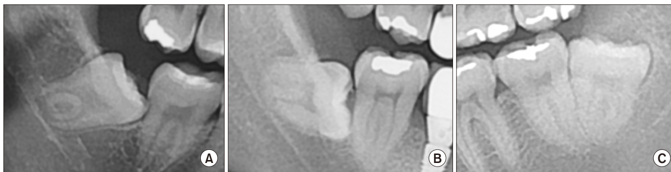
Fig. 4. Ramus relationship/space available. A. Class I. B. Class II. C. Class III. Eruption space was calculated as the ratio of the distance between the ascending ramus to the distal of second molar (a) and diameter of the impacted third molar (b), which was illustrated in Fig. 1. When eruption space (a/b) was larger than two-thirds, it was classified as class I, between one-third and two-thirds, it was classified as class II, and when smaller than one-third, it was classified as class III.

Jae-Young Kim et al: Modified difficult index adding extremely difficult for fully impacted mandibular third molar extraction. J Korean Assoc Oral Maxillofac Surg 2019