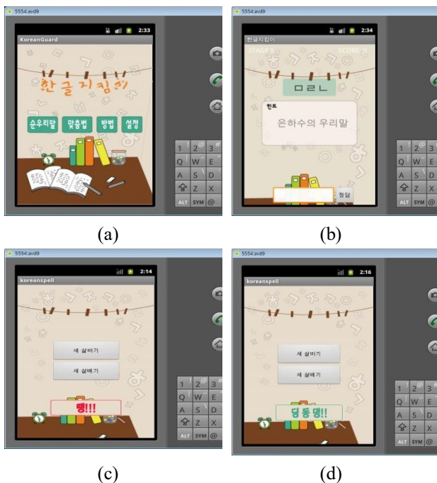
Fig. 5. (a) Main interface screen, (b) screen for composition game, and (c)-(d): screens for correction game.

In Table 1, #id_au is the identification of audio part, #id_vi is the identification of video part, and hint#id denotes the identification of hint track.