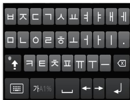
Fig. 2. QWERTY-type soft keyboard.

“Korean Guards” uses the QWERTY-type soft keyboard, which has 5 x3 dimension and 14/15 buttons. To keep from the frequent keyboard input errors, 27-button keyboard is rejected (see in Fig. 2) because of the limited size of screen. As the survey shows, the keyboard size of 72cm 2 marks the highest score for usability in games. However, the larger is reported to be the better [4].