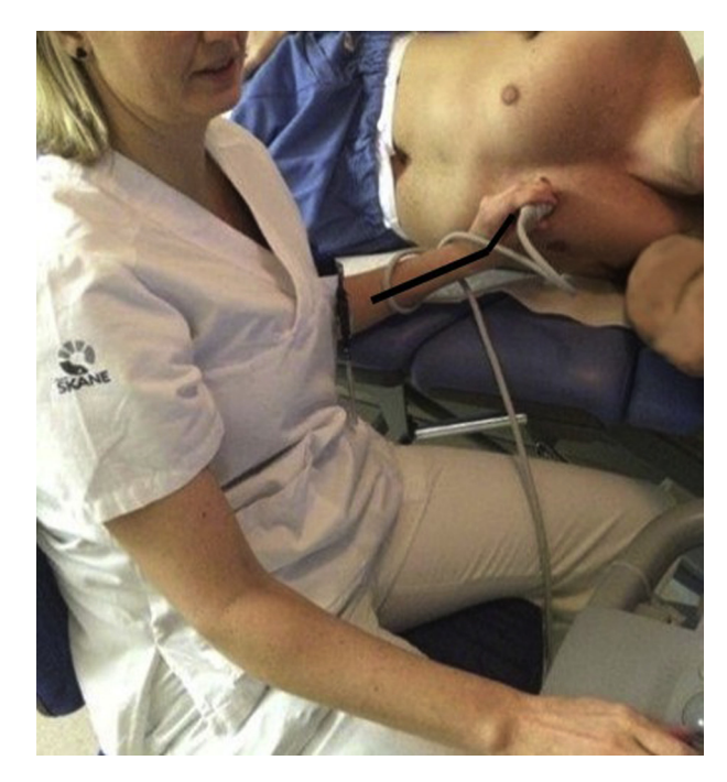
Fig. 1. Echocardiographic examination using Technique 1.

We investigated three different types of work tasks: echocardiography, other sonographic examinations (excluding echocardiography), and nonsonographic tasks. In echocardiography, the sonographer usually sits during the examination, maneuvering a transducer connected to the ultrasound machine by a cable in one hand, controlling the keyboard, integrated to the ultrasound machine, with the other hand, and at the same time, observing the images on a screen placed on top of the ultrasound machine. The sonographer applies pressure on the transducer with the hand to achieve optimal contact [20]. The sonographers in this study used one of three techniques, denoted T1 (10 participants), T2 (13 participants), and T3 (10 participants). In T1 the table was placed on the left side of the ultrasound machine, while in T2 and T3 the table was placed on the right side. In T1 the patient faced the examiner, who held the transducer in the left hand and handled the keyboard with the right hand (Fig. 1). In T2 the patient faced the examiner, who held the transducer in the right hand and handled the keyboard with the left hand (Fig. 2). In T3 the patient faced away from the examiner, who held the transducer in the right hand and handled the keyboard with the left hand (Fig. 3).