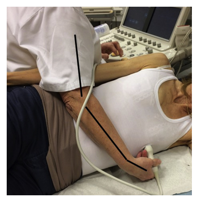
Fig. 3. Echocardiographic examination using Technique 3.