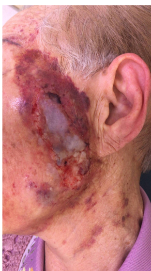
Fig. 2. After 5 days, bruising is worsened, but secondary healing is occurring.

dipine. The American Society of Anesthesiologists physical status of the patient was II. Preoperative laboratory findings and the chest X-ray image were normal. The electrocardiogram showed sinus rhythm with right bundle branch block and left anterior fascicular block. However, no significant abnormality was noted on echocardiography. Her skin was thin and inelastic due to aging, with extensive wrinkling in the face.