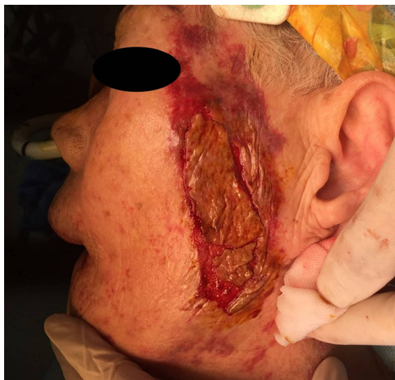
Fig. 1. Tape was removed and the skin peeled off.