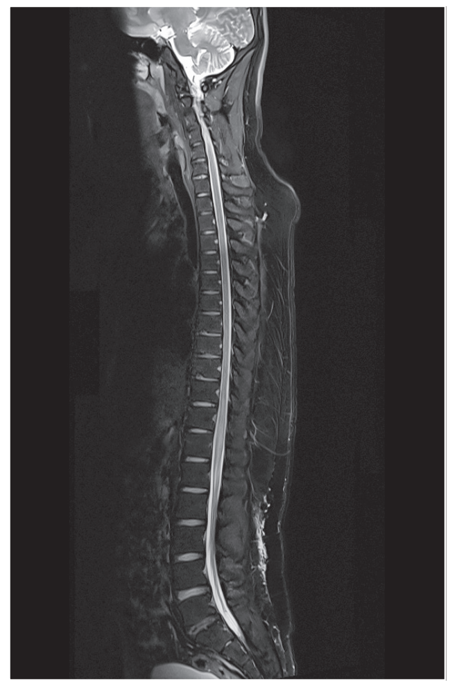
Fig. 2. Case 2 : a 19-year-old healthy Korean male. Midline sagittal T2-weighted MRI of the whole spine was obtained at the ER. MRI showed increased T2 signal intensity in the gray matter of the central spinal cord from T10 to the conus. MRI : magnetic resonance imaging, ER : emergency room.

was evaluated and diagnosed with complete spinal cord injury (American Spinal Injury Association class A) with absence of anal sphincter and bladder function. MRI of the lumbar spine without contrast showed only mild bulging of the L5–S1 disc and no other structural lesions that may develop acute paraplegia. He was transferred to our hospital for proper management and was admitted to the department of orthopedics. His initial neurologic examination showed no motor strength or sensation below the inguinal region. Laboratory tests showed mild leukocytosis, but there was no history or finding to suggest an infectious cause. Additional MRI of the thoracic spine with contrast was obtained, and diffused T2 prolongation of the central spinal cord from T10 to the conus medullaris was