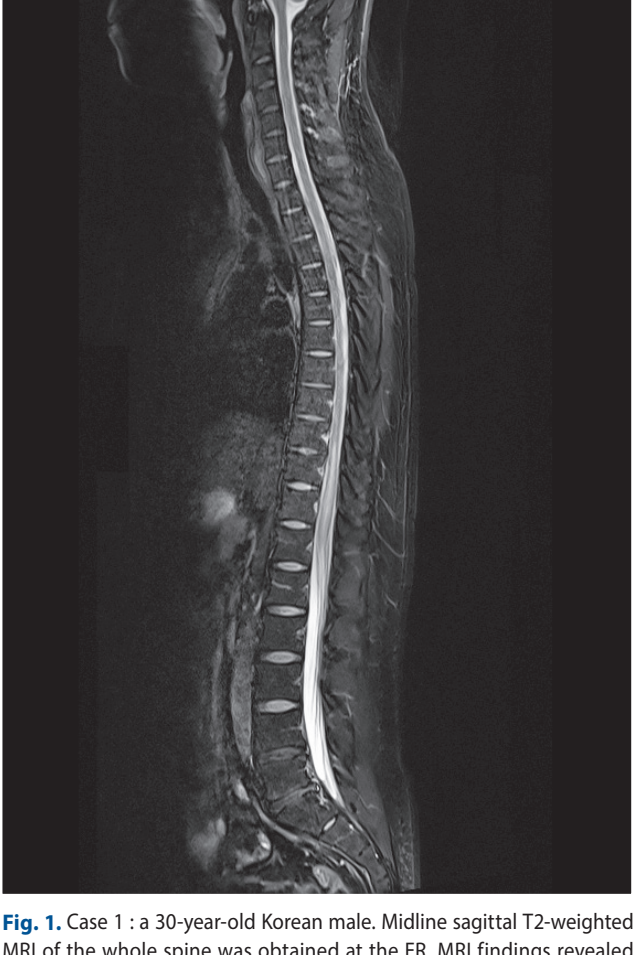
Fig. 1. Case 1: a S0-year-old Korean male, Midline Sagittal 12-Weighted MRI of the whole spine was obtained at the ER. MRI findings revealed hyperintense signals of the anterior central cord on T2-weighted imaging from T7 to the conus. MRI : magnetic resonance imaging, ER : emergency room.

creased and urinary retention was present. Bulbocavernosus reflex was intact. He underwent MRI of the thoracic and lumbar spine without contrast, which showed increased T2 signal intensity in the gray matter of the central spinal cord from T10 to the conus (Fig. 2); otherwise, MRI was negative for structural lesions including disc herniation, fractures, spondylosis, or vascular lesions. Laboratory tests were within normal limits. Considering his clinical history as a first time surfer, the patient was suspected of having surfer's myelopathy. He was admitted to the department of neurosurgery, and we focused on maintaining the degree of hypertension (average mean arterial blood pressure >85 mmHg) and did not administer steroids. His motor grade of the lower extremities recovered to