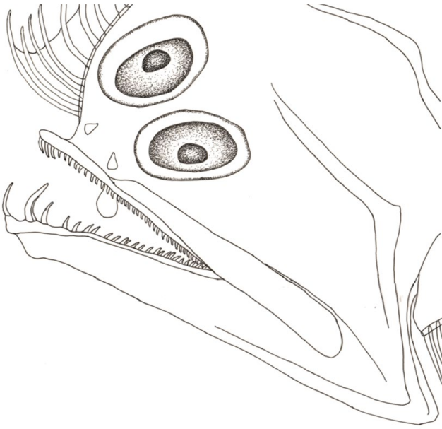
Fig. 2. Shape of teeth on both jaws.

32°48.02'N, 126°43.33'N, 16.24°C, 34.37 psu, southern Jeju Island, 111 m depth, 19 October 2016, R/V Tamgu 21, bottom trawl, collected by Y.S. Heo and H.J. Yu.