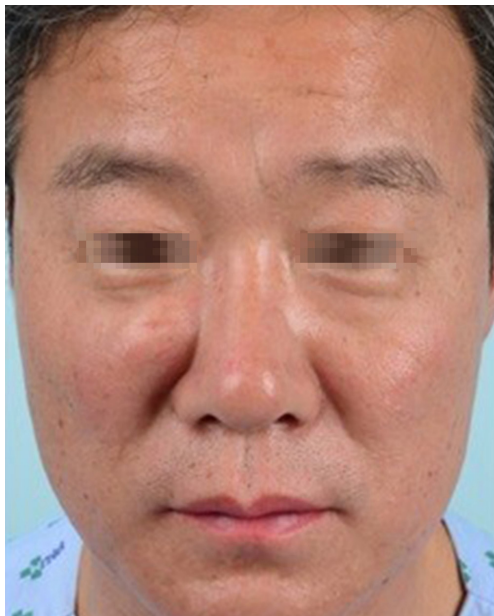
Fig. 1. A 45-year-old male patient presented with the chief complaint of the palpable mass in the right cheek area.

In addition, involvement of adjacent orbicularis oculi muscles was observed, and there were restrictions on the evaluation due to the air of the right maxillary sinus, but the findings suggestive of involvement of adjacent maxilla were not definite. Based on physical examination and imaging findings, we planned to perform resection through a subciliary approach, with a higher possibility of a true mass than vascular malformation in mind.