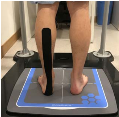
Fig. 2. Calf muscle tape placement