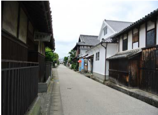
Fig. 1(a). Historic town scenery of model area

There is a voluntary disaster prevention organization that implements firefighting training once or twice a year, which has achieved some success in firefighting. We also found that there is a mutual assistance system, in which district welfare officers and chiefs of wards play leading roles during disasters. Although the voluntary disaster prevention organizations and the mutual assistance system are organized, their specific roles and cooperation are unclear. The effectiveness of these organizations should be improved.