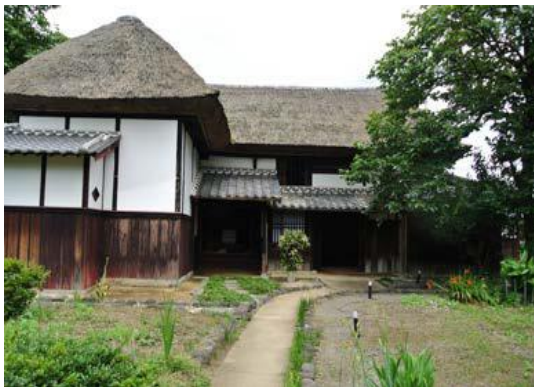
Fig. 1(b). Hizen-Hama shuku in Kashima City of Saga Prefecture in Japan