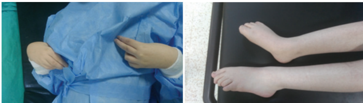
Fig. 1. The patient's hands and legs