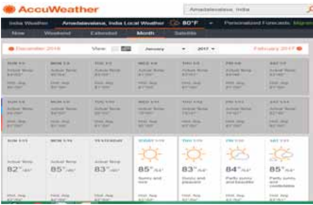
Figure 4 Weather data for Integration