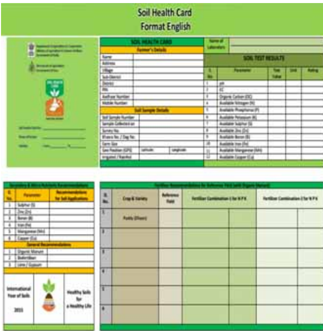
Figure 3 Soil Data for Integration