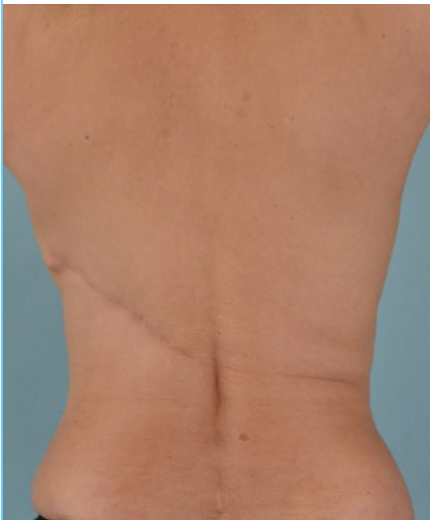
Fig. 2. Less visible scar on the donor site

A patient who was operated on without an elongated axillary incision line.