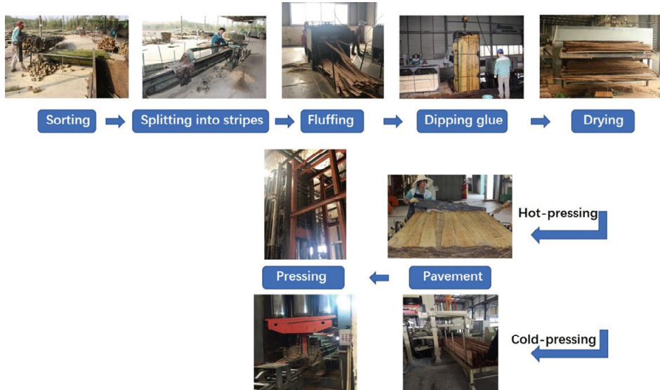
Fig. 2. Manufacturing of BFBCs with two pressing methods.

were totally impregnated in PF adhesive with a 12% solid content for 10 min. The moisture content in impregnated OBFMS was controlled at approximately 8%-10% via oven drying for 12 h. Then, the prepared materials were hot-pressed at 145°C at a rate of 1.0 mm/min. For cold pressing, the glued OBFMs were laid and pressed in a chamber (Fig. 2) and then were transmitted on the curing device for 14 h at 135 °C. The curing duration of manufacturing was 14 h. After completing the above processes, the obtained BFBCs were placed at ambient temperature for cooling. The BFBC density was determined by measuring its air-dry weight and volume after the composites were kept in a conditioning room with a relative humidity of 65 ± 3% at 25 °C ± 2 °C for 2 weeks. After measurement, the samples with exact densities of 1.0, 1.1, and 1.2 kg/m 3 were selected for evaluating properties.