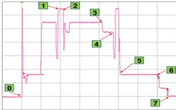
Fig. 2 Current Consumption Measurement (Before duty cycle application)

Receiving a toggle command and sending a default response command are shown in Fig. 2, from points 3 to 4, respectively.