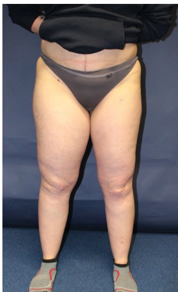
Fig. 1. Chronic stage II lymphedema in lower extremities