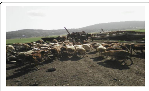
Fig. 2 Communal mixed livestock production system in the study area

Wollo highland sheep breed is one of the indigenous sheep breed found in the highland part of South Wollo administrative Zone at North East part of Ethiopia. They were characterized by short fat tail with short twisted/