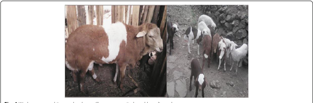
Fig. 4 Washera ram and its crossbreds on village community based breeding scheme