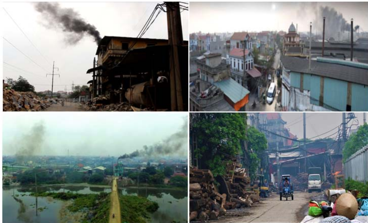
Figure 3. Black smoke from a base production in Phong Khe