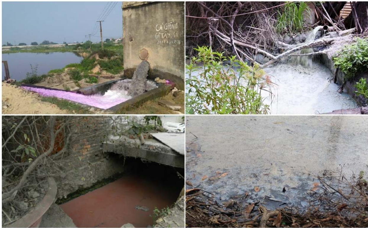
Figure 2. Untreated wastewater from the paper productions directly to the Ngu Huyen Khe River.

pled paper craft villages discharged directly into the receiving source. Therefore, wastewater with high concentration of color chemicals and other smelly substances are freely discharging into the river and residential drainage system. Paper, tars, pulp, and chemicals used in production have directly affected local people's health. Over 5,000 m 3 untreated wastewater with heavy effluents of COD, BOD and SS from residual chemicals, pulp, fibers with high levels of organic are discharged from this village every day, running directly to the canals and Ngu Huyen Khe River. As a result, Ngu Huyen Khe River, once clean enough for agriculture purposes, has become "Dead River" due to its smelly, black water.