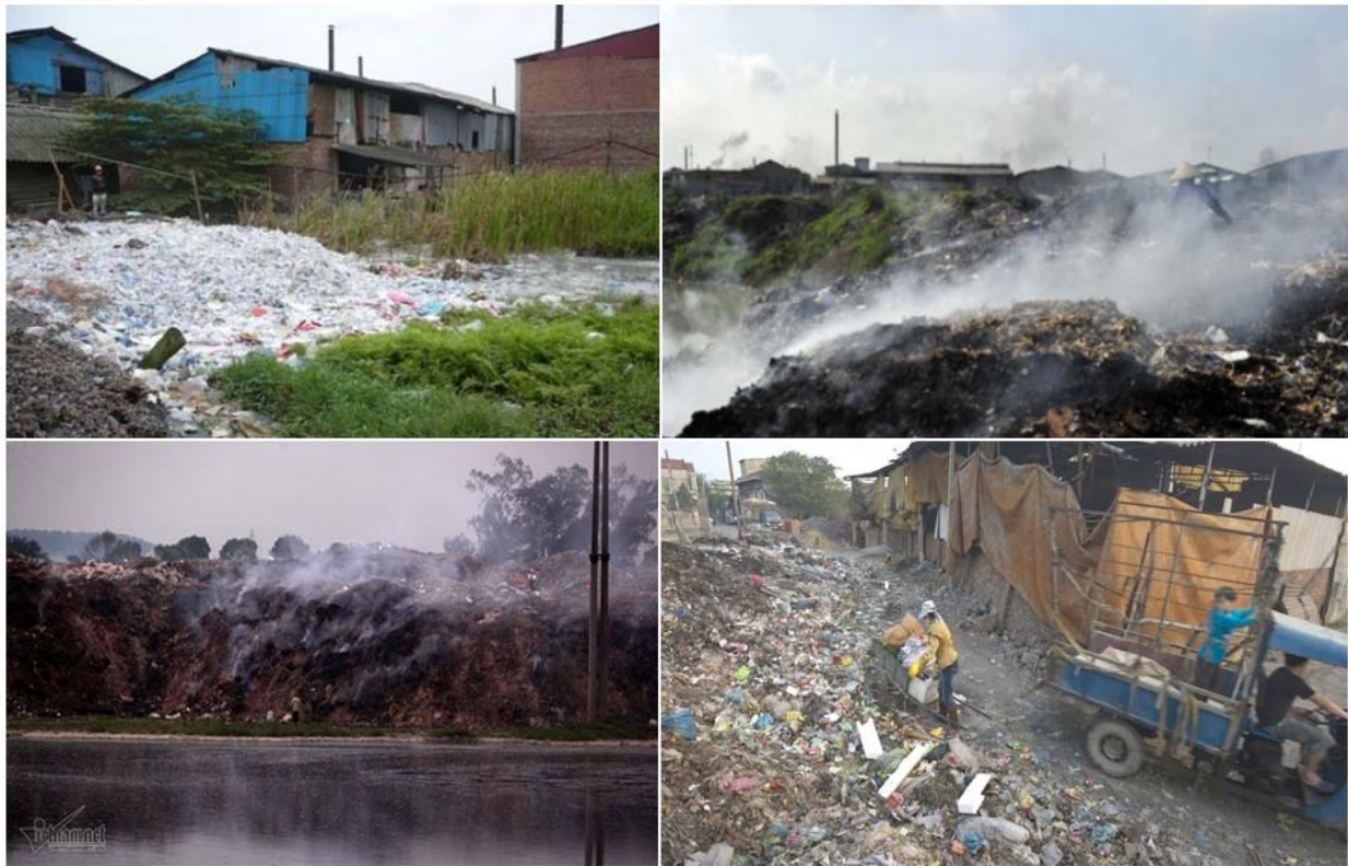
Figure 6. Discharge and burning garbage in Phong Khe paper recycling village

tion facilities, seized and destroyed 190 tons of waste, and police in Phong Khe ward regularly patrol, they detected and punished 26 cases of violation, recovered and destroyed 41 tons of waste. According to a report by the People's Committee of Phong Khe ward, in 2016, the number of people who burned waste of boiler, was reduced but some households still surreptitiously violated affecting the living environment [16].