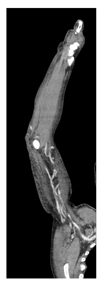
Fig. 3. Computed tomography angiography. The presence of a thrombus extending from right cephalic vein to brachial vein.

Secondary UEDVTs are those associated with various factors like malignancy, central venous catheter, oral contraceptative use etc. Trauma is reported to be responsible for 3-17% of secondary UEDVT [2].