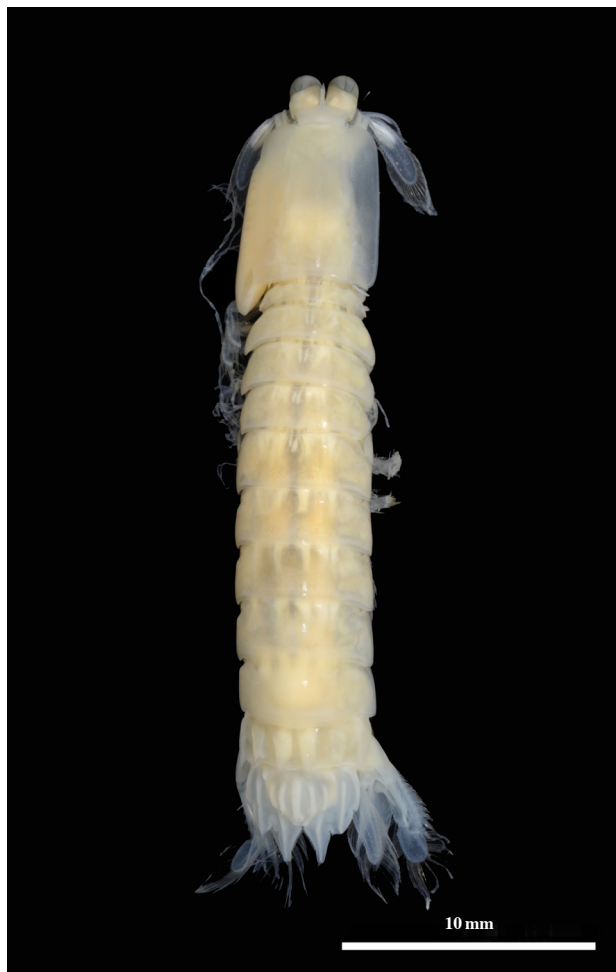
Fig. 1. Gonodactylaceus falcatus (Forskål, 1775), male (MADBK 600103001). Whole animal, 32 mm. Scale bar = 10 mm.

Material examined. Korea: Jeju Island, Seogwipo-si, Seogwipo-dong, near Munseom Island, by SCUBA diving: 1♂,