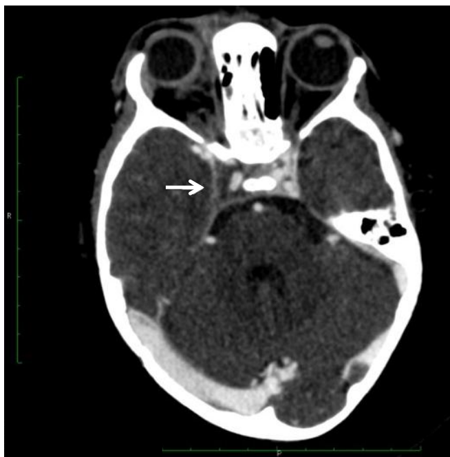
Fig. 1. Filling defect seen within the enlarged right cavernous sinus (arrow) with proptosis of right globe for patient 1.

A previously healthy 7-year-old boy was admitted