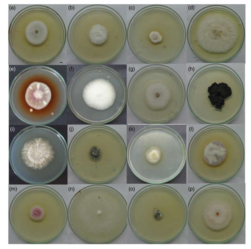
Figure 1. Colony characteristics of eight days old endophytic fungal isolates of Berberis aristata on potato dextrose agar.(a) Fusarium solani (A1), (b) Colletotrichum coccoides (A2), (c) Fusarium nematophilum (A3), (d) Clonostachys rosea (A4), (e) Fusarium solani (A5), (f) Colletotrichum gleosporioides (A6), (g) Colletotrichum kahawae (A7), (h) Phyllosticta capitalensis (A8), i) Phomopsis spp. (A9), (j) Aspergillus flavus (A10), (k) Alternaria macrospora (S2), (l) Alternaria solani (S3), (m) Fusarium lateritium (S6), (n) Cercospora citrullina (S7), (o) Colletotrichum gleosporioides (S8), (p) Myrothecium inundatum (S9).

A total of 131 endophytic fungal isolates belonging to 18 species and 10 genera were obtained from 330 surface sterilized segments of different tissues of B. aristata . In terms of total isolates under endophytic taxa, 10 were isolated from leaves, three from