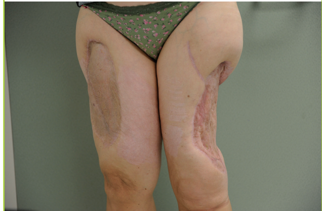
Fig. 7. Left thigh second reconstructive attempt

The patient's left thigh had a good functional outcome upon discharge (PID#54) to a rehabilitation center but the aesthetic result was unsatisfactory with split-thickness skin graft coverage.