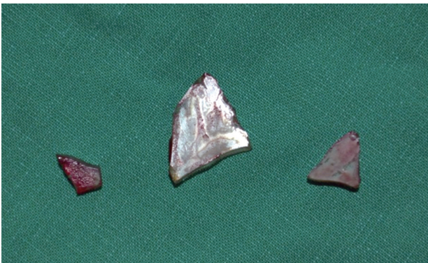
Fig. 5. Removed three fragments of glass.

be attributed to remaining capsular contracture (Fig. 6).