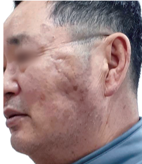
Fig. 6. Postoperative 27-month photograph.

FB impaction in the maxillofacial area is uncommon and a third of FBs are unnoticed in this region [5]. The types of FBs vary widely from nonvegetative materials, such as glass, metal bullets, and stones to vegetative materials [6]. Impacted FBs can cause complications, including infection with pain, swelling, peripheral nerve damage, pseudoaneurysm, and synovitis [6]. Foreign materials are often antigenic and produce chronic inflammatory re-