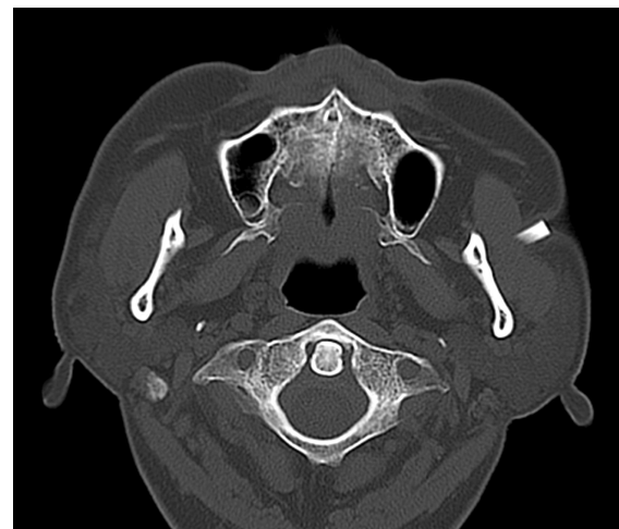
Fig. 3. Computed tomography image showing largest glass fragment.