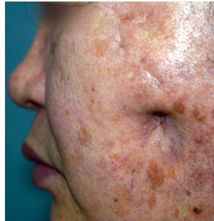
Fig. 1. Preoperative gross photograph.

Saline irrigation and the application of betadine-soaked dressing was performed on the cheek incision for 2 days and the inflammation, which was accompanied by unclear discharge, was alleviated. Under local anesthesia, scar tissue debridement and layer by layer closure were followed. The wound healed without complications. Postoperative facial motor dysfunction and sensory deficit were not observed. Postoperative 27-month photograph showed that the unsightly dimple on the left cheek was greatly improved, and only a slight remnant dimple remained, which could