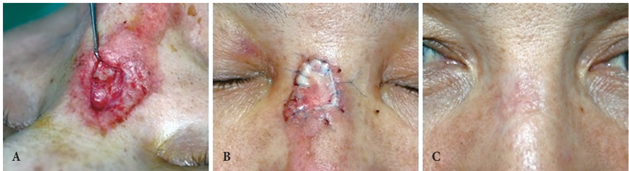
Fig. 3. Case 1. (A) A 53-year-old man had a 21×17 mm 2 of full-thickness skin defect on the nasal dorsum after a bicycle accident. (B) Postoperative view at 1 day after the Terudermis grafting. (C) Postoperative view at 18 months of follow-up.

FTSG, full thickness skin graft; STSG, split thickness skin graft.