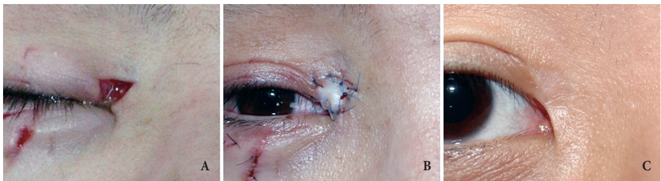
Fig. 4. Case 2. (A) A 15-year-old boy had a 5×6 mm 2 of skin defect on the medial canthus after he was pricked by a tree branch. (B) Postoperative view at 1 day after the Terudermis grafting. (C) Postoperative view at 19 months of follow-up.