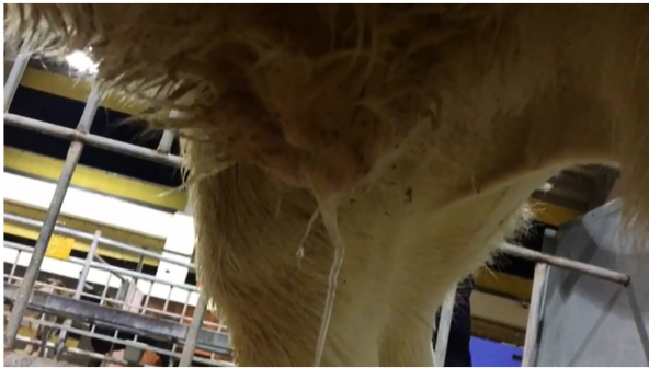
Fig. 1. Calf dribbling urine through the patent urachus while urinating.