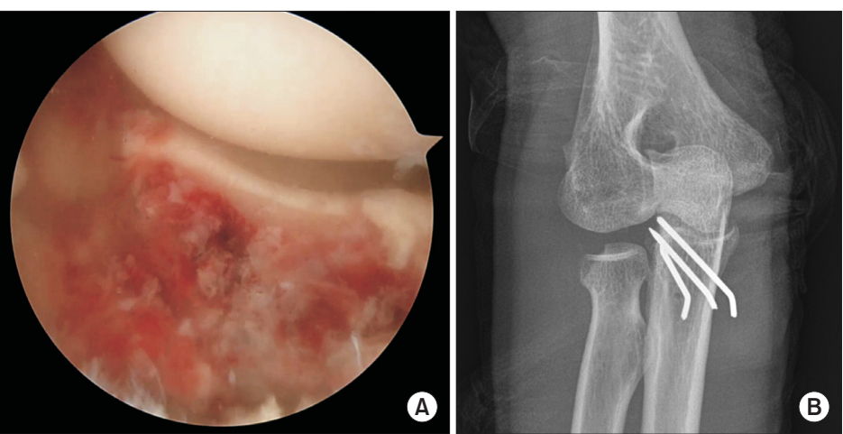
Fig. 2. Arthroscopic view (A) and anteroposterior radiography (B) of radial head fracture after excision of fracture fragment.