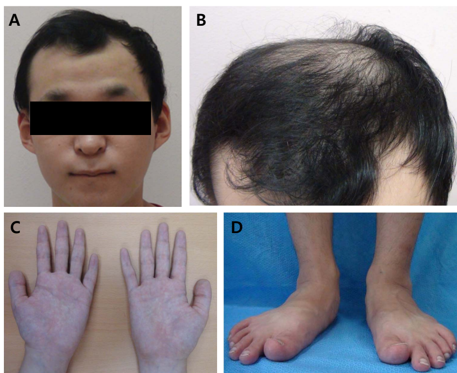
Fig. 1. The clinical features of trichorhino-phalangeal syndrome include sparse eyebrow, broad nasal tip, and broad nasal ridge (A), receding frontal hairline and sparse hair on vertex area (B), shortness of both thumbs (C), and great toes (D).

Typical clinical features of TRPS1 include growth impairment, sparse hair, long philtrum, broad nasal ridge, short metacarpals and brachydactyly. According to a recent cohort study the morbidity of TRPS was closely related to decreased mobility, joint