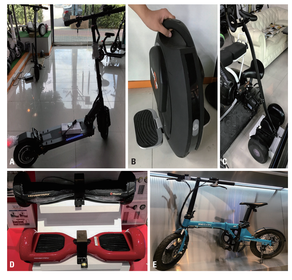
Fig. 1. Pictures of the personal mobility. (A) Electric scooter, a stand-up scooter with a small platform with two wheels driven by an electric motor. (B) Electric unicycle, a single-rider electrically powered unicycle. (C) Self-balancing scooter with handle. (D) Self-balancing scooter with no handle (hoverboard), a self-balancing powered vehicle with two parallel wheels, where the rider's foot position or the sensor in handle causes the vehicle to move. (E) Electric bicycle, a bicycle propelled in part or solely by recharge-able electric batteries.

We performed a retrospective 2-year observational study,