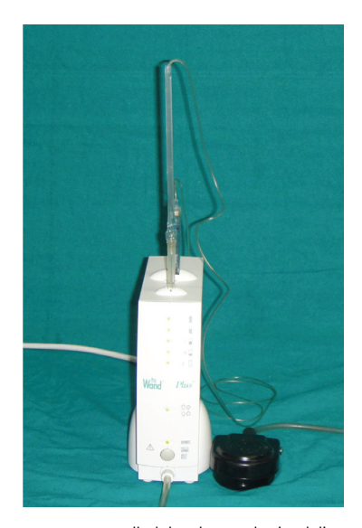
Fig. 2. The computer controlled local anesthetic delivery system.

This is a prospective randomized split-mouth study. Patients aged 18-65 years with periodontal disease, requiring bilateral LA in the same arch, were recruited for the study. Patients who are allergic to LA or any of its components, medically compromised, smoking, pregnant, lactating, or taking corticosteroids or non-