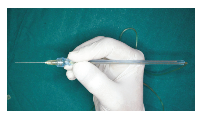
Fig. 4. Pen-grasp used in the computer controlled local anesthesia delivery system.

CCLAD. This is consistent with the findings of the studies by Yenisy [11] and Nusstein [13]. Lower pain may be attributed to the delivery of anesthetic solution at constant pressure, which is rapidly absorbed by surrounding tissues. A steady flow of 1 drop of anesthetic every two seconds is maintained by the stepper motor in the driver unit of CCLAD irrespective of the density of tissues. In contrast, in the conventional syringe, manual control does not allow consistent flow. The resistance encountered when injecting into dense connective tissue causes the operator to increase force on the syringe plunger, thus increasing the anesthetic volume that distends the tissues, thereby resulting in pain.