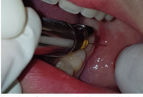
Fig. 2. Image of the computer-assisted intraosseous injection with \operatorname{Quicksleeper}^{\mathfrak{B}}

All patients were required to complete a form for evaluation of the duration of anesthesia and postoperative complications. Following surgery, each patient was prescribed the following medications: amoxicillin (500 mg) 1 tablet 4 times a day for 5 days, if the patient is allergy to amoxicillin, clindamycin (300 mg) 1 tablet