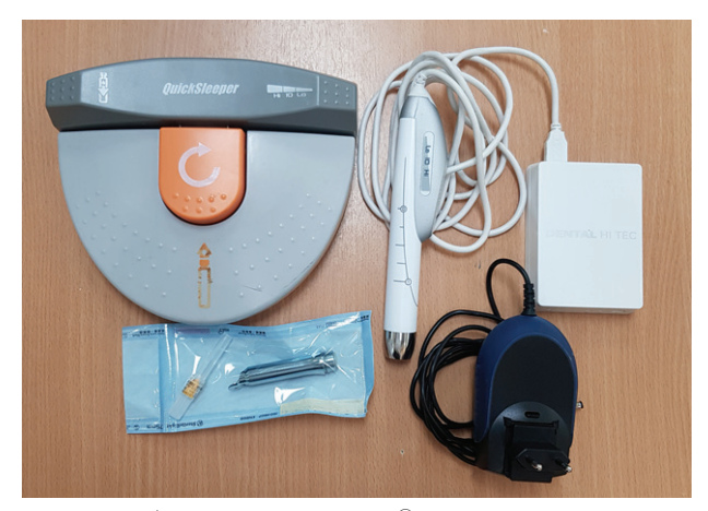
Fig. 1. The 5<sup>th</sup> generation Quicksleeper<sup> \mathbb{R} </sup> device used for this study.

Quicksleeper<sup>®</sup> (Dental Hi-tec, Cholet, France) is a one-step IOI machine for CAIOI. This computercontrolled local anesthesia delivery system (CCLAD) is designed to be a pen-grasp like injection syringe that fully monitors the speed of diffusion and the volume of the anesthetic agent into the cortical bone by means of a Bluetooth pedal. CCLAD have been utilized for pain control in several kinds of dental procedures including endodontic treatment of irreversible pulpitis, periodontal surgery, surgical removal of mandibular third molar,