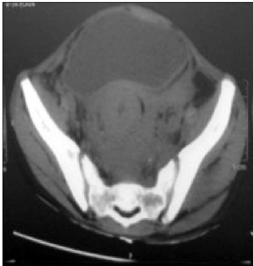
Fig. 2. Computed tomography scan of the patient showing circumferential rectum thickening with frozen pelvis.

of inflammatory pathology. Colonoscopic evaluation revealed linear ulcers in distal colon. Biopsy from these lesions was also non-specific. Patient was taken home at persistence of parents.