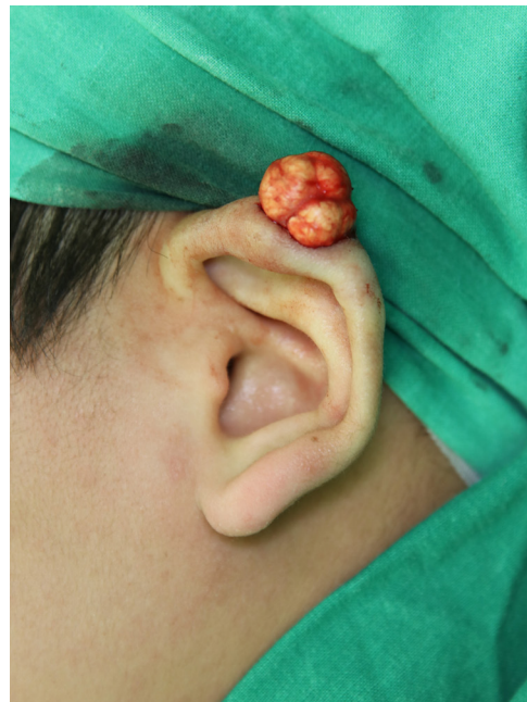
Fig. 3. Intraoperative photograph of the auricular mass.