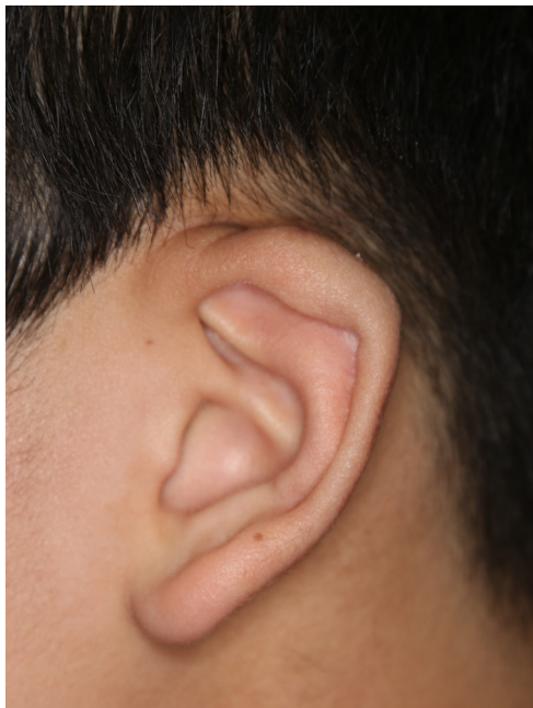
Fig. 5. Postoperative photograph at 9 months.