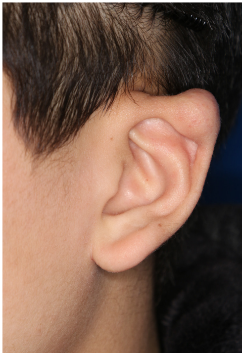
Fig. 1. Mass on the helix of the left auricle measuring approximately 2 cm in diameter.