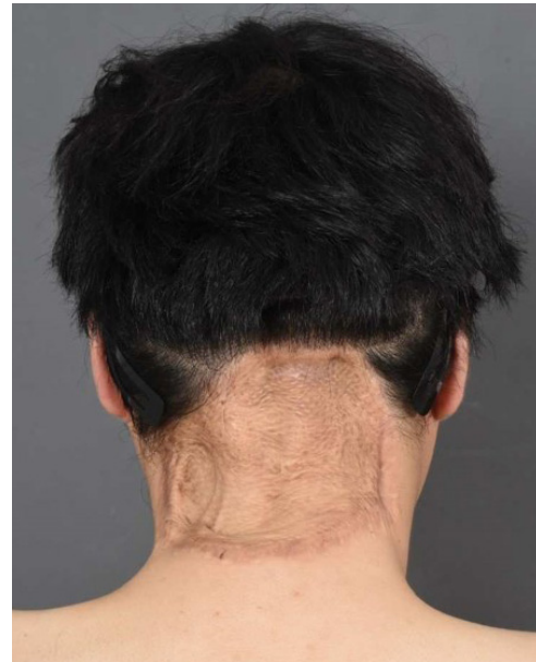
Fig. 5. Gross image obtained 5 years postoperatively. There is no palpable mass.

No potential conflict of interest relevant to this article was reported.