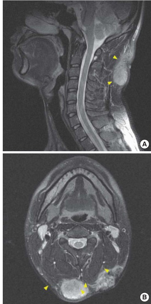
Fig. 3. Magnetic resonance image (MRI) of the neck. (A) Sagittal view. (B) Axial view. The preoperative MRI scan shows a lobulated soft tissue lesion on the subcutaneous layer of the posterior neck, sized about 9 cm with involvement of the superficial fascia (arrowheads) and infiltration to the proximal trapezius muscles on both sides.

onance image (MRI) revealed lobulated soft tissue lesions involving superficial fascia and infiltrating into both proximal trapezius muscles (Fig. 3). Positron emission tomography-computed tomography (PET-CT) revealed three hypermetabolic mass lesions about 4 cm in size on the subcutaneous layer of the posterior neck, and no distant metastases was observed. In the plastic surgery department, wide excision including a 1.5-cm safe margin and reconstruction with a free anterolateral thigh flap were performed. After extensive excision, histological examination revealed skin adnexal carcinoma, originating from