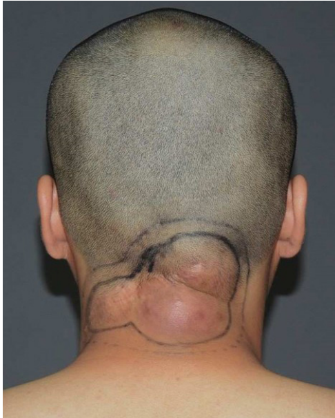
Fig. 1. Preoperative gross image. There were three confluent firm masses on the nuchal area, measuring about 9×6 cm.