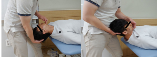
Fig. 1. PNF neck flexion exercise