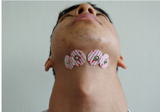
Fig. 3. Position of electrodes

1cm apart (Valenzuela et al., 2006) (Fig. 3). Furthermore, hair was removed to prevent measurement error and the electrodes were attached after wiping with medical alcohol. The sampling rate for the EMG signal was set to 1024 Hz. After the measurements, data were filtered and processed using Biopac Student Lab Pro (Biopac System Inc. CA. USA) on a personal computer. In order to remove noise within the measured EMG signal, band pass filtering was conducted on the raw data and smoothing was also performed as RMS 20 ms after rectification (Lee, 2014).