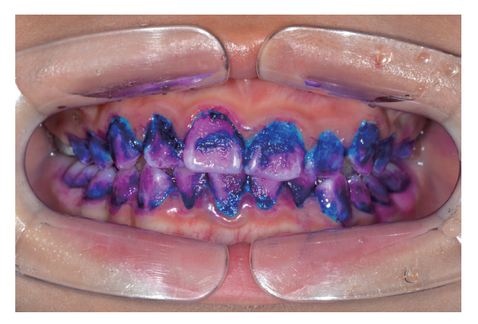
Fig. 2. The tooth-surfaces were changed to pink or red, blue or purple, and light blue.