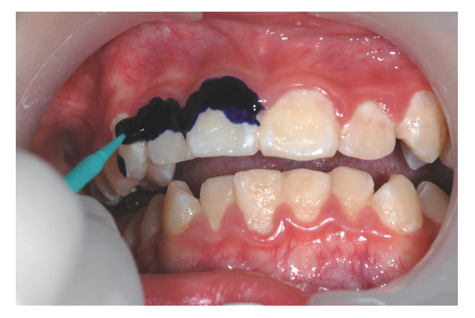
Fig. 1. The 3 tone plaque disclosing gel was applied on tooth surfaces with a microbrush.