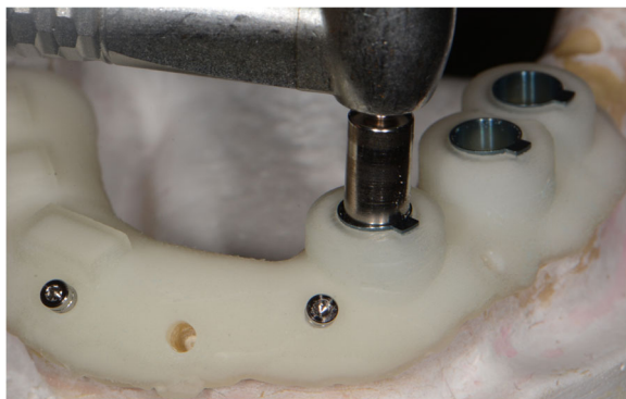
Fig. 2 The surgical guide for implant placement. CBCT and CAD/CAM are used to produce a surgical guide for implant placement

3DP and CAD/CAM has involved itself in almost every aspect of implant dentistry, from the planning phase to finalizing the prosthesis. The only component left is the implant itself, which is still commonly manufactured by traditional methods. One of the new possible theories with 3DP technology is to produce a customized implant with the analog that mimics the root of the missing tooth, as an alternative to the traditional implant design (threaded, straight, or tapered). With similar dimensions to the original root, the customized implant could provide better matching with the root socket [88]. Recently, many types of research have further explained that this theory have been conducted on cadaver models, animal models, or in clinical trials.