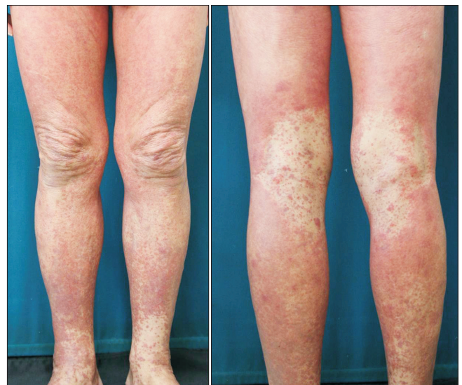
Figure 1. Patient photographs showing the pruritic patches, macules, and papules in both legs extended to the trunk and both arms after 2 weeks of anti-tuberculosis treatment.

Copyright © 2017 The Korean Academy of Tuberculosis and Respiratory Diseases. All rights reserved.