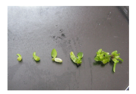
Fig. 3 Different stages of the prtocorm like bodies (PLbs)

The seeds are thin and transparent. The cells of seed coats