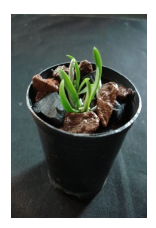
Fig. 5 Potted plant of Cymbidium aloifolium (L)

are varied in size and shape. Such variations that were observed in the present study are in agreement with the observations noted by the previous workers (Clifford & Smith 1969; Ekanthappa, 1981). It has been earlier established that the nature of seed coat is of great taxonomic value within the Orchidaceae (Stoutamire, 1963, Kalimuthu et al. , 2007)).