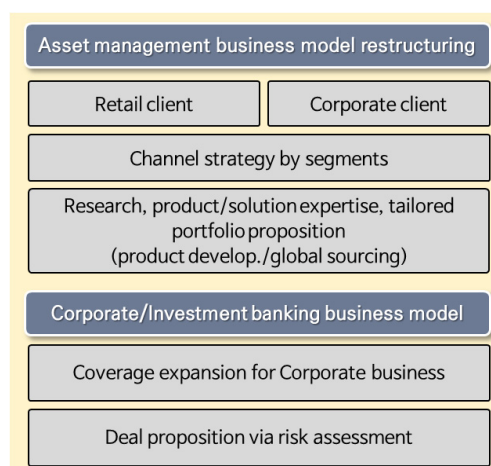
Fig. 3. Private banking business structure

countries. Considering collectively, investment advisory service is broader advisory offer including specialized information service, tax advisory service, real estate investment assistance.